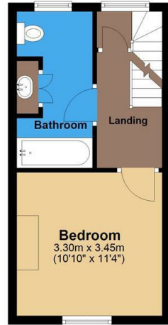
First Floor Approx. 23.7 sq. metres (254.8 sq. feet)